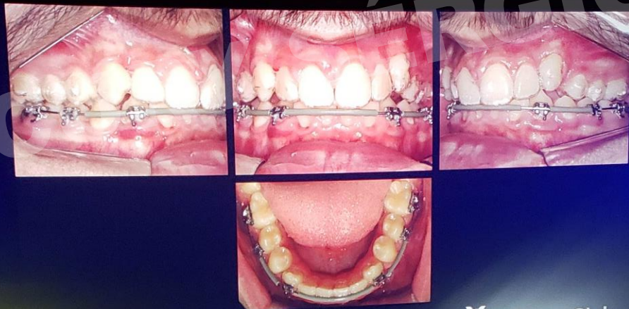
Alinhadores e braquetes: híbrido